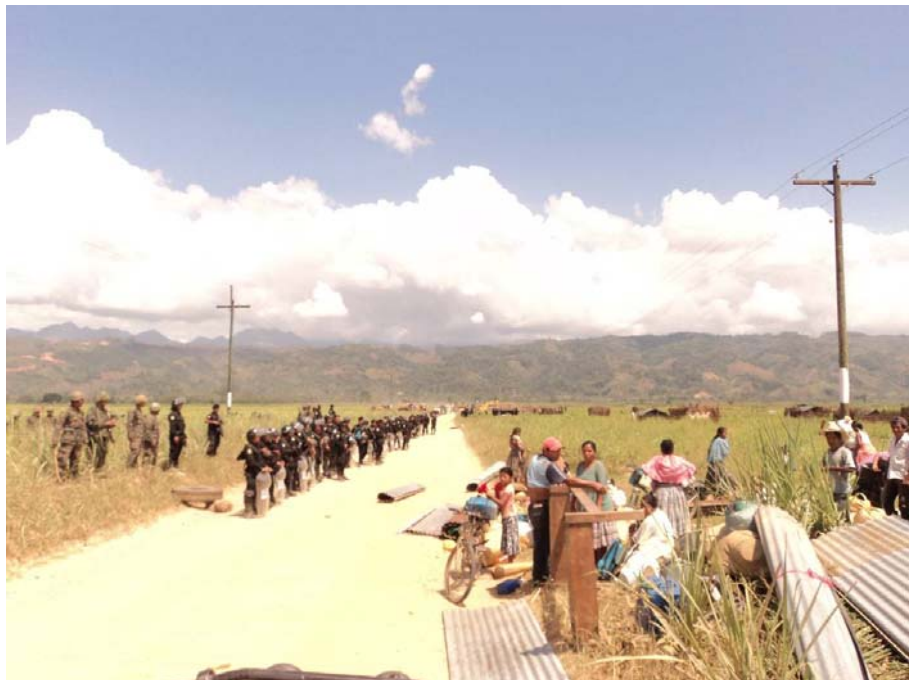
Miralvalle, Polochic Valley, Guatemala, 15 March 2011. The community was evicted, their houses and crops destroyed.

EMBARGOED UNTIL 00:01 HRS GMT 22 September 2011