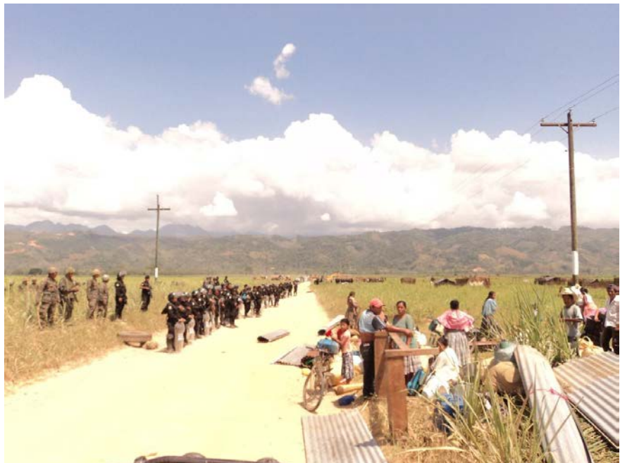
Miralvalle, Polochic Valley, Guatemala, 15 March 2011. The community was evicted, their houses and crops destroyed.

The new wave of land deals is not the new investment in agriculture that millions had been waiting for. The poorest people are being hardest hit as competition for land intensifies. Oxfam's research has revealed that residents regularly lose out to local elites and domestic or foreign investors because they lack the power to claim their rights effectively and to defend and advance their interests. Companies and governments must take urgent steps to improve land rights outcomes for people living in poverty. Power relations between investors and local communities must also change if investment is to contribute to rather than undermine the food security and livelihoods of local communities.