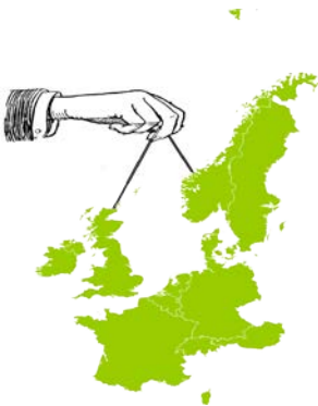
Figure 1: Global land deals

227 million hectares are reported to have been acquired since 2001, an area of land the size of North-Western Europe.