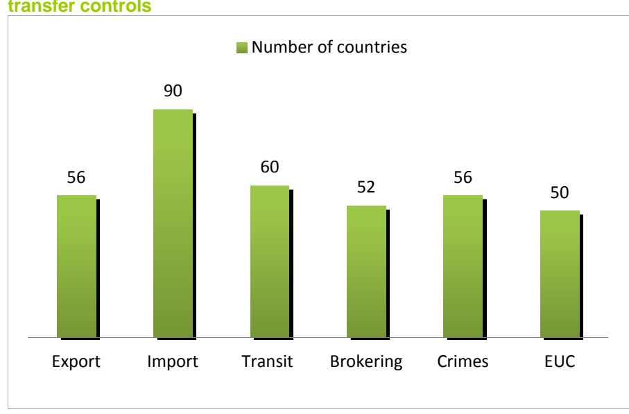
Figure 3: Number of countries reporting key types of international arms transfer controls

While there have been some improvements in the last 10 years in addressing weak foreign arms-control laws, particularly throughout Eurasia, many countries still lack the necessary controls to effectively curb unscrupulous arms brokers or extradite brokers who violate US law. According to the US Department of Justice, the US government can usually work with a foreign government to arrest and extradite arms brokers who violate US law as long as the foreign country has some sort of basic arms control laws.<sup>72</sup> However, out of a total 154 countries that have reported to the UN on the their implementation of the UN Program of Action on SALW, only 73 countries said they have controls on the export of SALW (see Figure 3).73 Only 56 governments have indicated they have specific crimes related to the illegal international transfer or illegal manufacturing of SALW, a necessary component for extradition.<sup>74</sup> In some cases, countries reportedly do not have specific crimes associated with violating UN arms embargoes.75 As of 2006, Asia, particularly Pacific Asia, accounts for a large portion of the countries without export controls, but countries in the Americas, Africa, and the Middle East also are missing such controls.<sup>76</sup> In most cases, however, countries need more than just basic controls to stop problematic arms brokers.