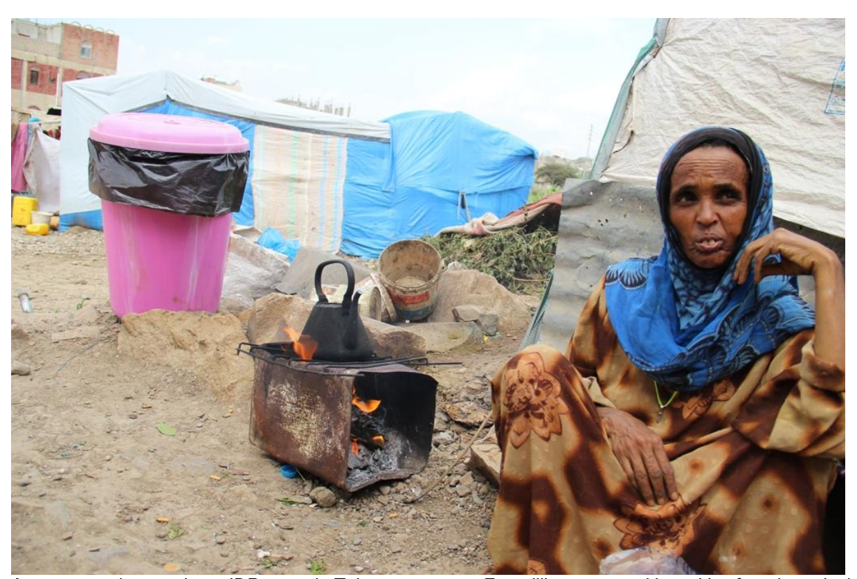
A woman makes tea in an IDP camp in Taiz governorate. For millions, tea and bread is often the only thing they have to eat.

The whole world must act now to avoid famine in Yemen, as two years of brutal conflict have led to what the UN describes as the worst humanitarian situation on the globe, with nearly 7 million people facing starvation.