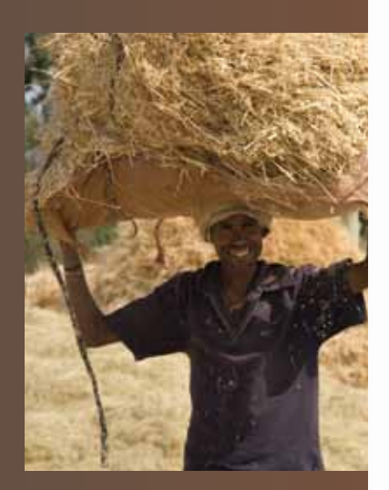
A farmer carrying his teff from the field

This partnership will enable thousands more poor farmers and other food insecure households to manage weather vulnerability through an affordable, comprehensive risk management program that builds long-term resilience.