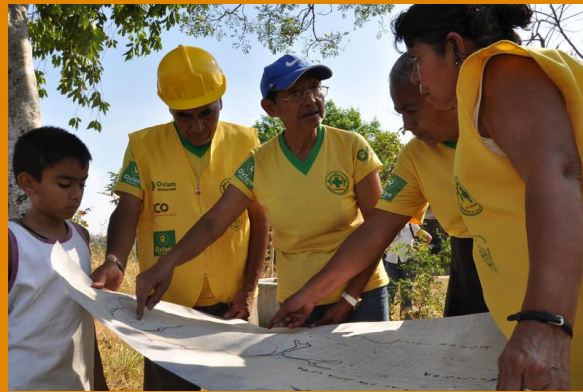
West Africa 2012