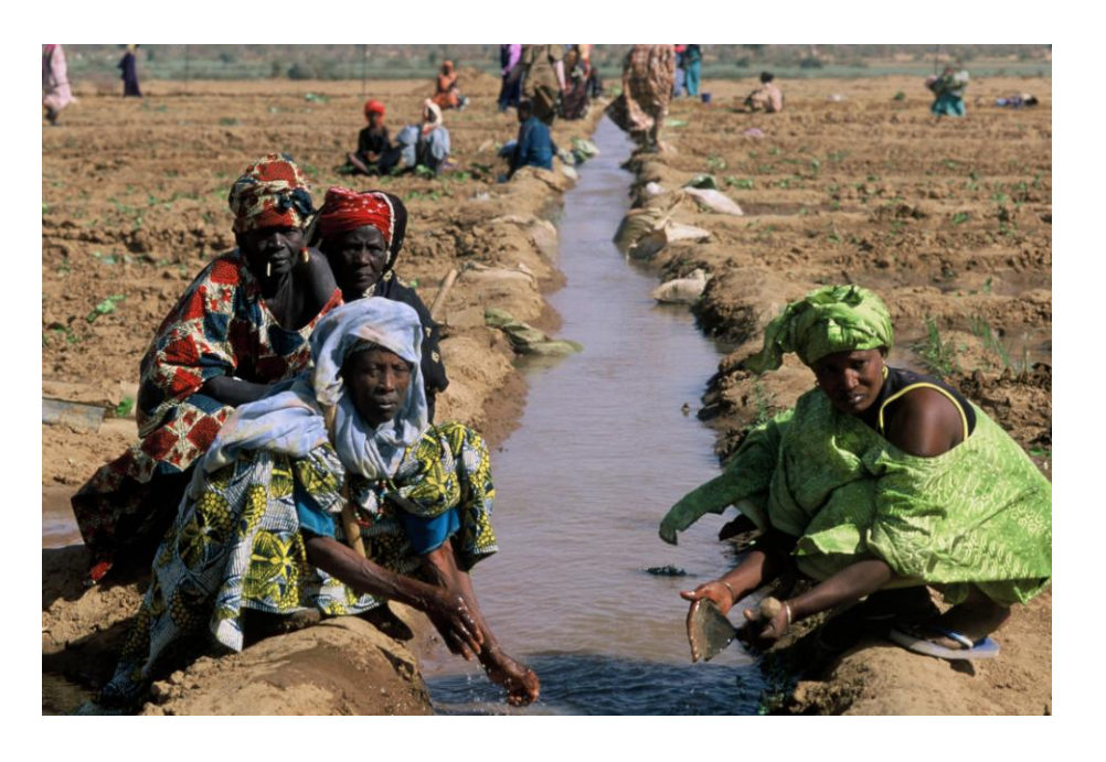
Women wash their hands in an irrigation channel in the lands of Djoudé's women cooperative, Mauritania.

Building a rescue package to set the MDGs back on track